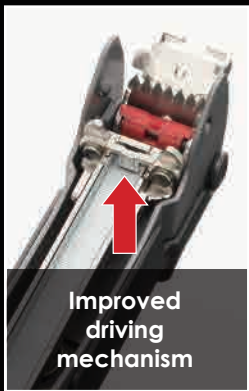
Improved driving mechanism