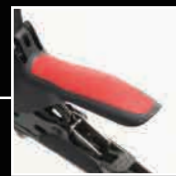
Ergonomic design RUBBER GRIP