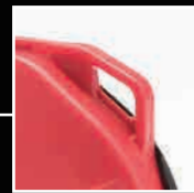
REINFORCED STRAP HOLE