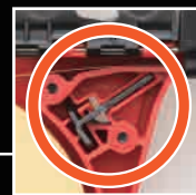
JAM CLEARING STICK